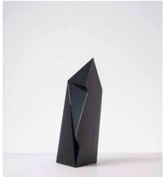
Black Object (2010–11)

Epoxy resin and laser cut stainless sheet Edition of 3